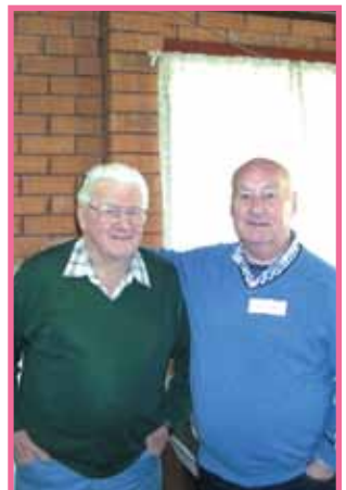
Old Boys and Girls - Annual Founders Day Reunion, Picton NSW