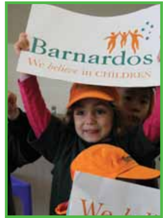
Barnardos Auburn centre