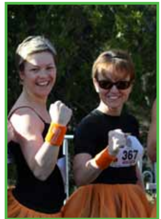
Our community fundraisers