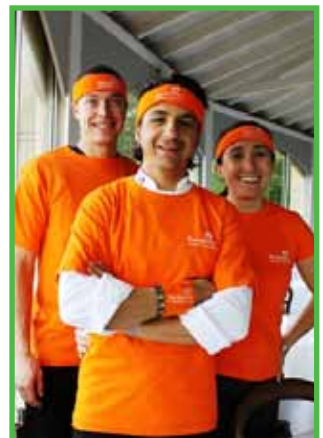
The Pulu City to Surf fundraisers

Visit www.barnardos.org.au or call 1800 061 000 for more information