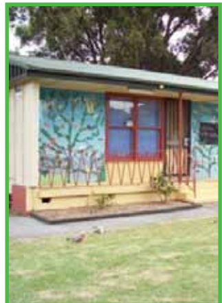
Bundaleer, South Coast