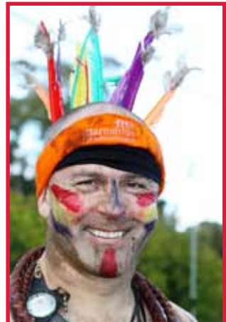
Tough Bloke Challenge 2011

“The organisations and their staff that we work with want to have a positive impact on the social problems faced by our community. They recognise that by working together we can make a real difference to children early in life - a difference that will last forever.”