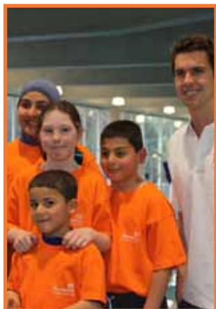
Health and wellbeing program

Our Home Interaction Program for Parents and Youngsters (HIPPY) at our south coast centre successfully gained an extension of funding to enrol a new group of 25 families in 2012. The program improves early literacy, school-readiness and provides better opportunities for children to succeed