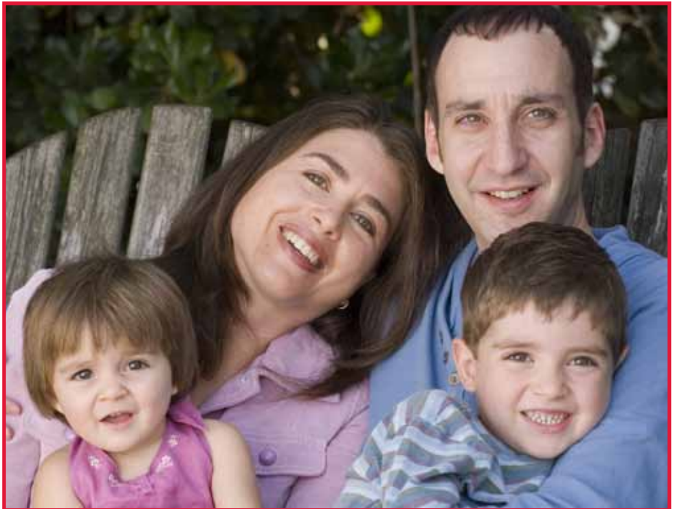
Supporting stable and loving families