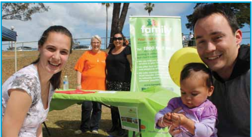
Illawarra Family Referral Service, operated by Barnardos