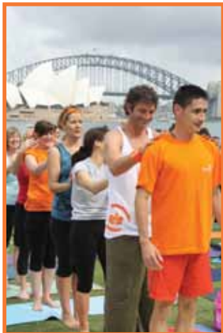
Yoga Aid 2011