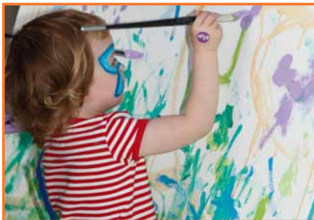
Supporting social inclusion