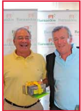
Peter Pan Committee Golf Day