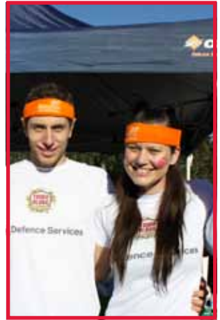
Our community fundraisers

Despite a softening domestic economy, flat employment growth and persistent consumer cautiousness charitable giving by Australians is growing. 1