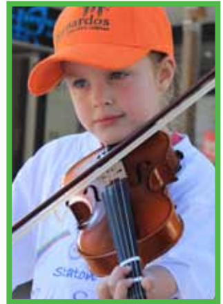
Busking for Barnardos 2011