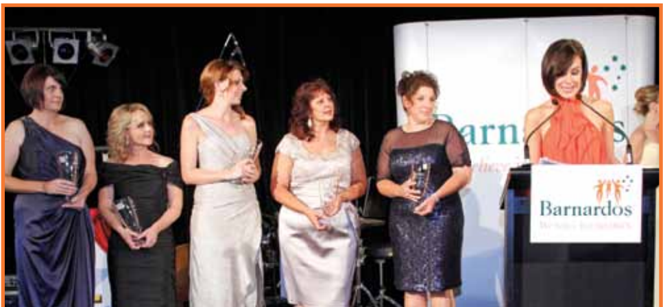
2012 Barnardos Australia's Mother of the Year Awards