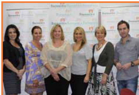
Barnardos Australia's Mother of the Year - Judges