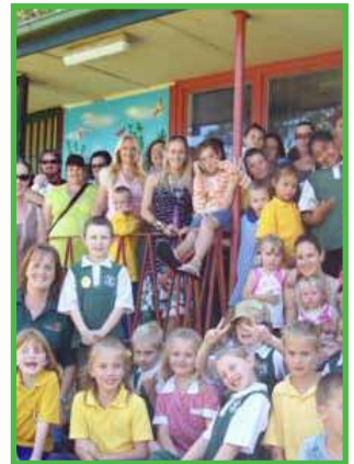
Bundaleer, South Coast

“At Bundaleer we are building partnerships that add value to the community. We are laying the foundation for the children on the estate to develop into healthy young people, get an education and break out of the intergenerational unemployment that characterises the area.”